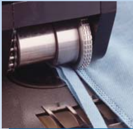
Choose from a variety of stitch patterns to perfectly fuse and seal seams.