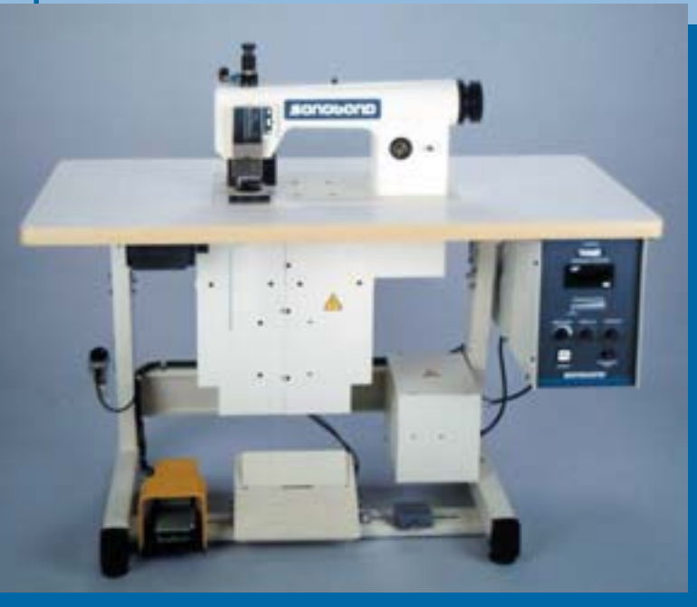
The SeamMaster/LaceMaster seals, sews, and trims synthetic patterns in just one pass.