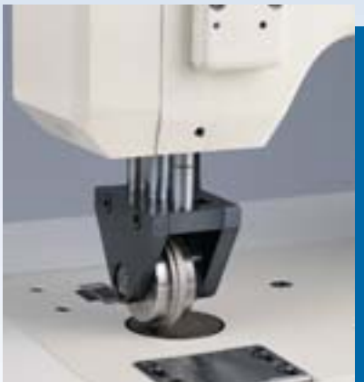
The SeamMaster 86 provides a higher clearance for bulky fabrics or hand-guided operations.